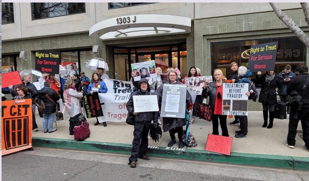
Advocates at the Sacramento rally in January 2024.